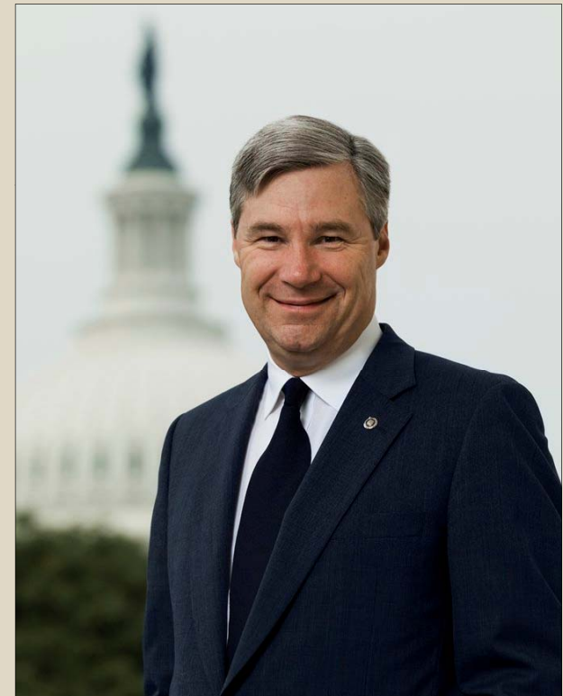
Sen. Sheldon Whitehouse