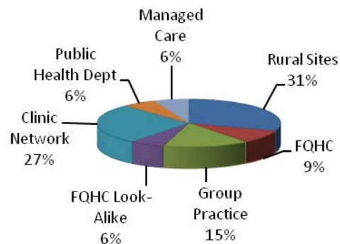
NHSC Practice Types Among National Council Members